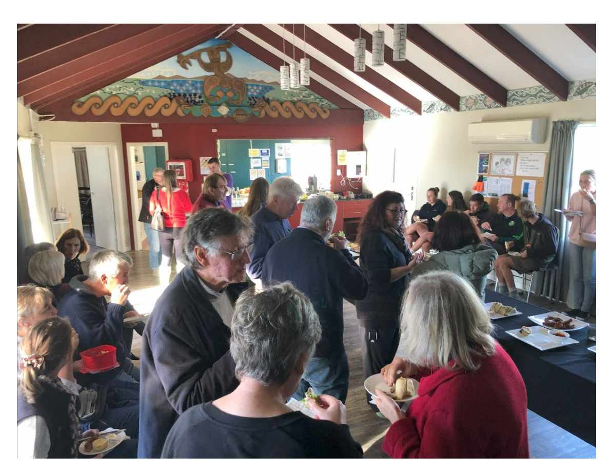
Enjoying good Kai at the Mahinga Kai workshop