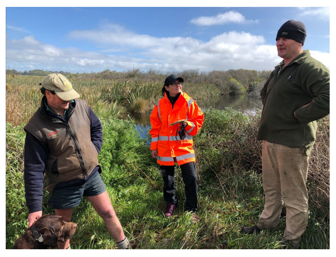
PDP staff talk with local landowners about the Jollies Brook Project