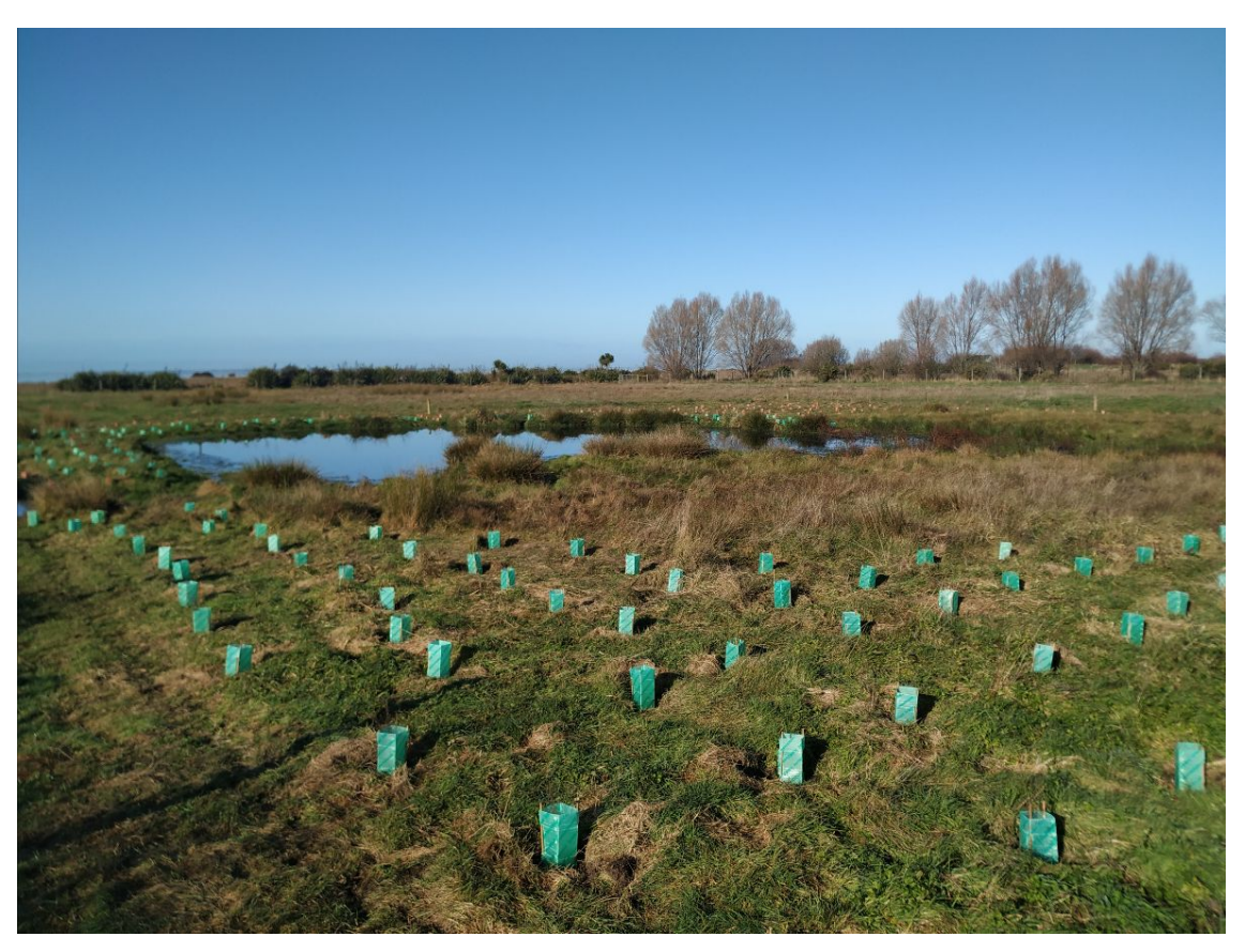
Te Waihora wetland restoration site

Thank you to all our ESAI members who have made these restoration projects possible by volunteering to have native plantings along their creeks and wetlands, and working with us to make these projects a reality. We hope that our combined restoration efforts create a legacy along our lowland waterways that we can all be proud of.