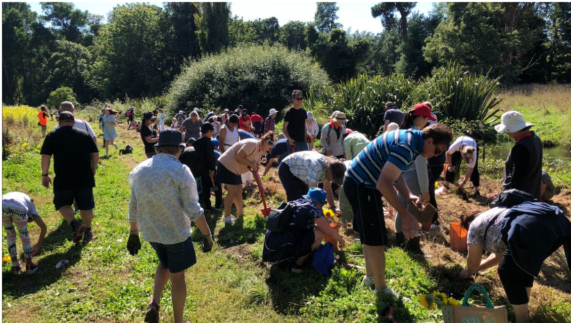
Participants in the Open Farm event at Streamside Organics got to plant natives along the Irwell river.