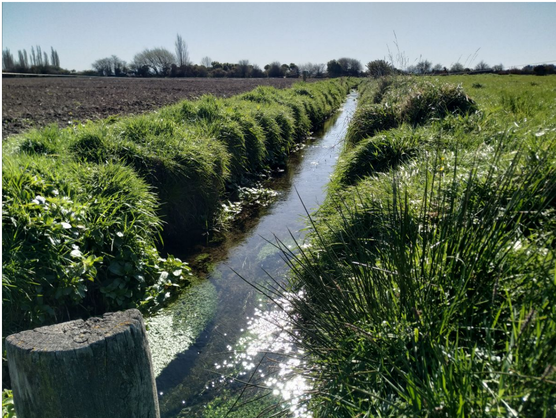
One of the sites due to be planted this Autumn.

https://www.surveymonkey.com/r/ESANewsletter